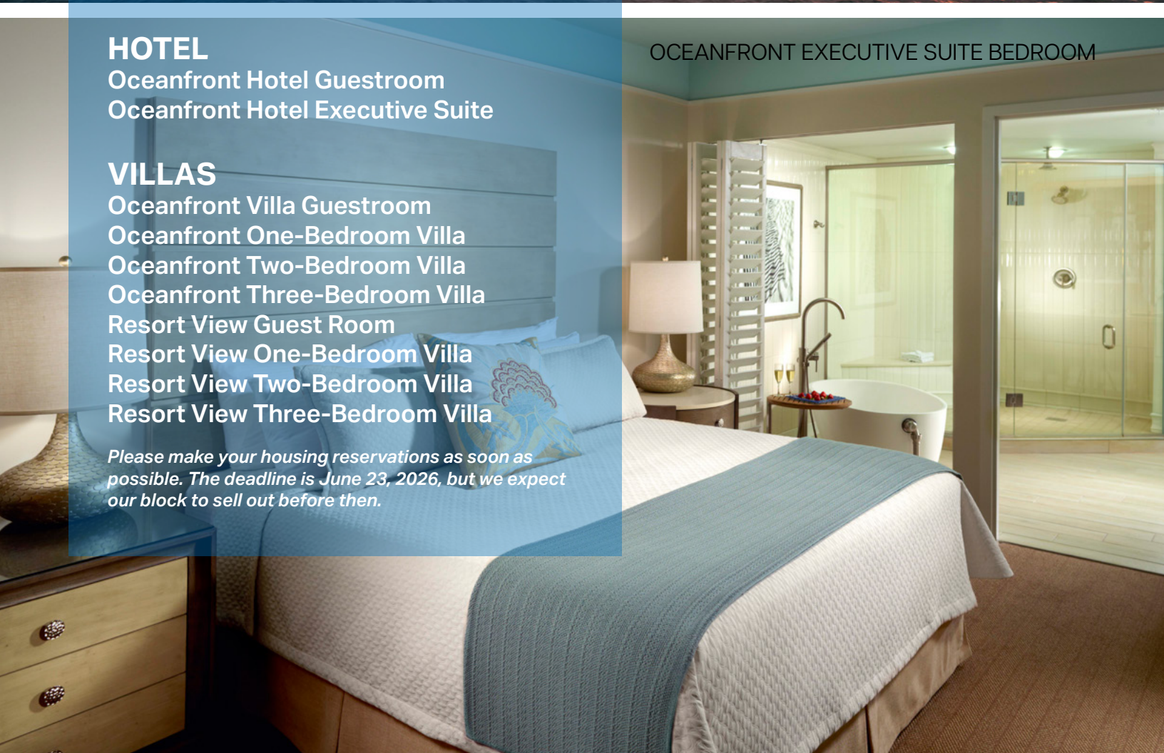
OCEANFRONT EXECUTIVE SUITE BEDROOM

Please make your housing reservations as soon as possible. The deadline is June 23, 2026, but we expect our block to sell out before then.