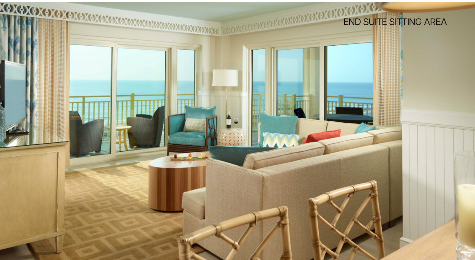
END SUITE SITTING AREA

Click HERE to Register to Attend or visit www.sacsconference.com . If you have questions please contact heather@sacsconference.com .