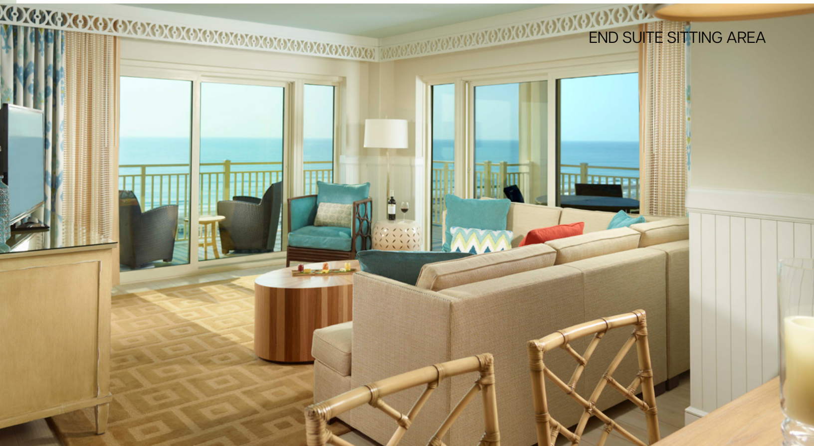
END SUITE SITTING AREA