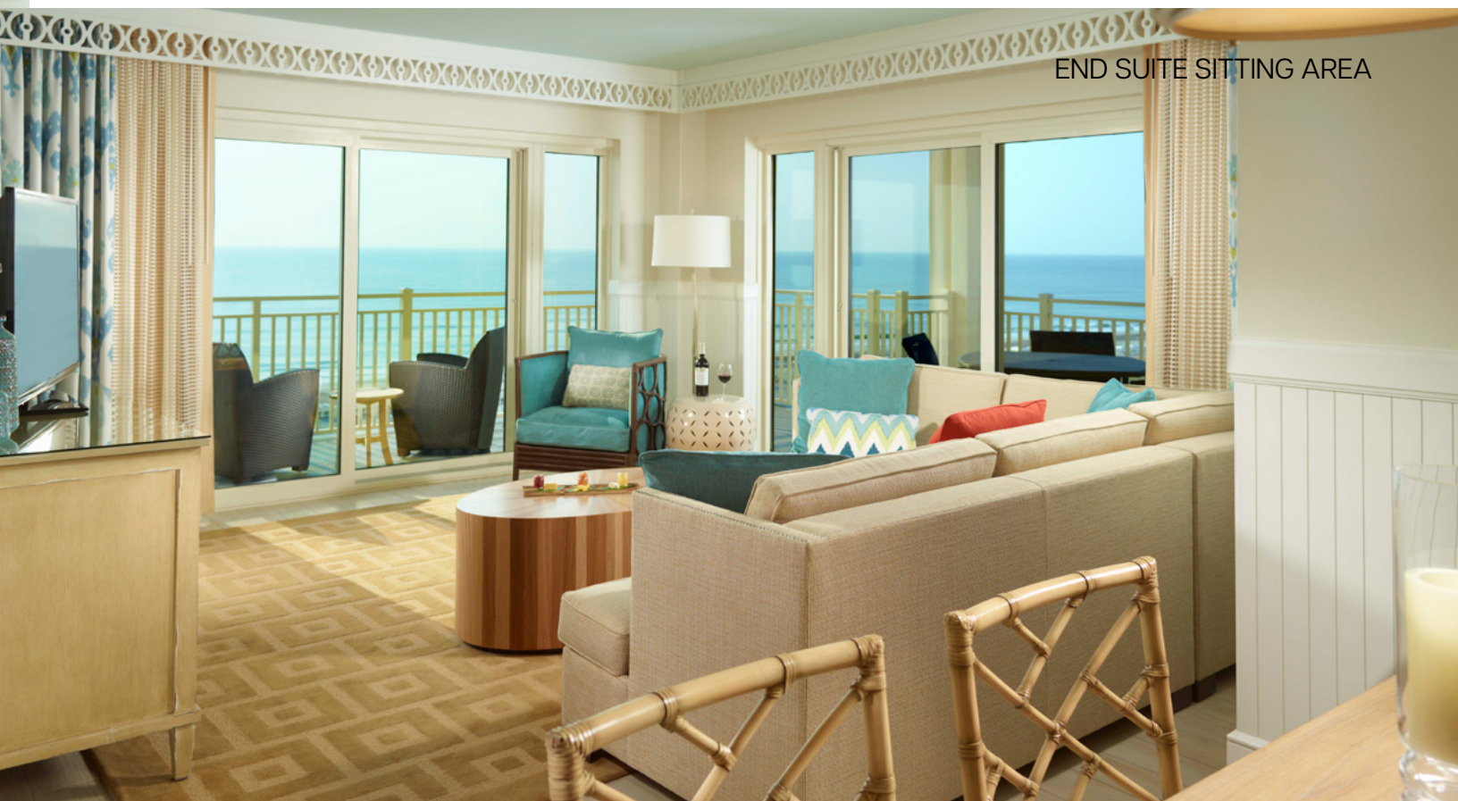
END SUITE SITTING AREA

Click HERE to Register to Attend or visit www.sacsconference.com . If you have questions please contact heather@sacsconference.com .