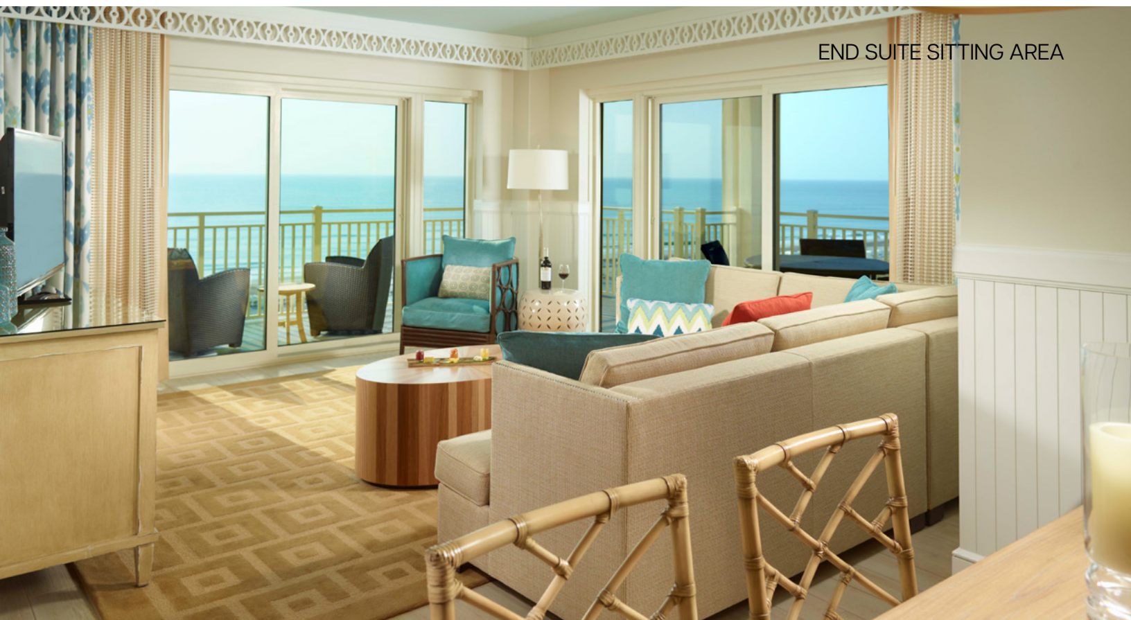
END SUITE SITTING AREA