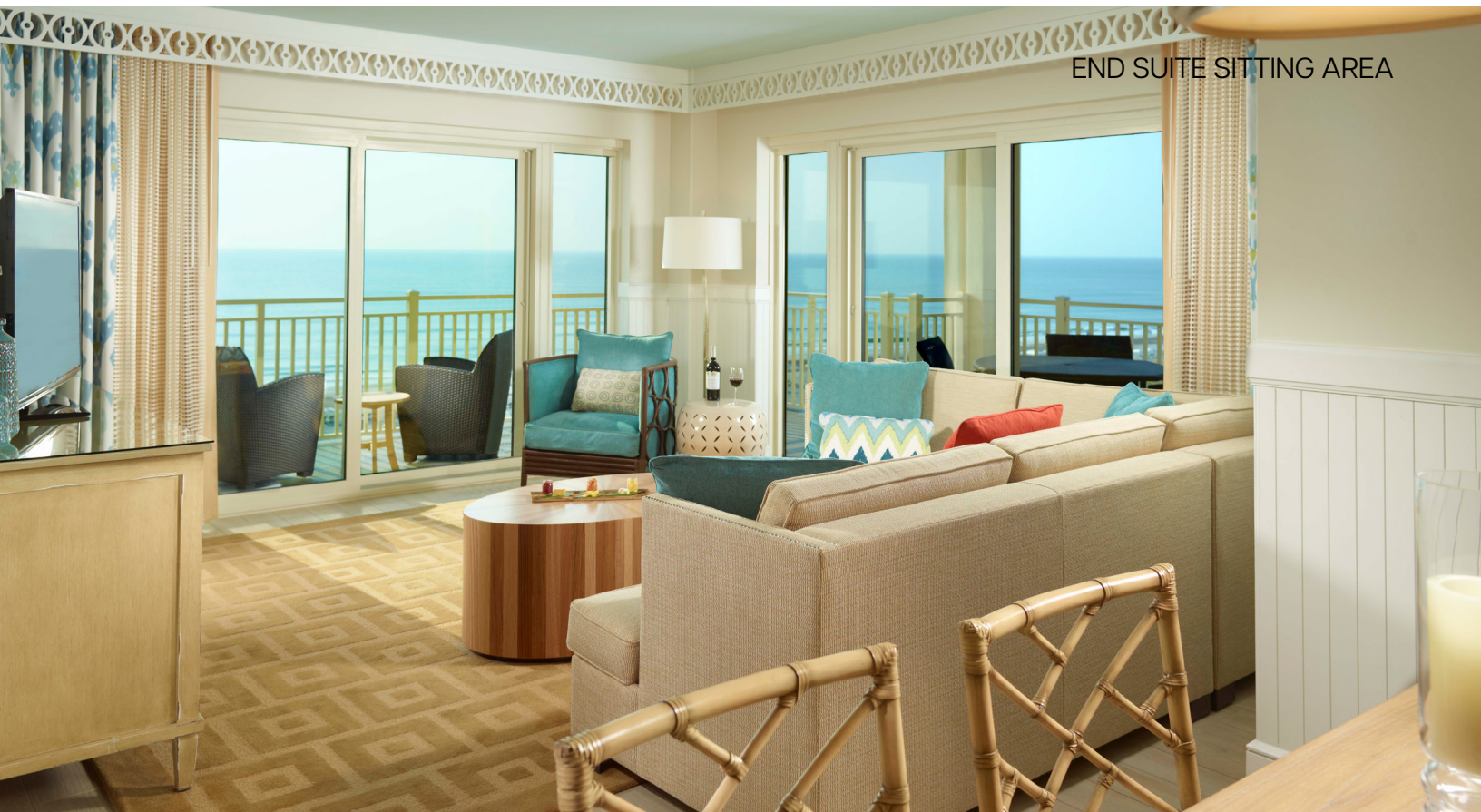
END SUITE SITTING AREA